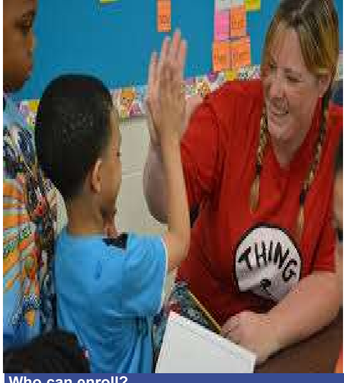
Who can enroll?